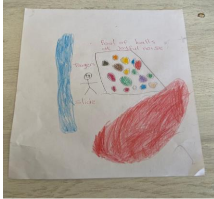
Drawings from the little ones about what they liked at Joyful Noise.